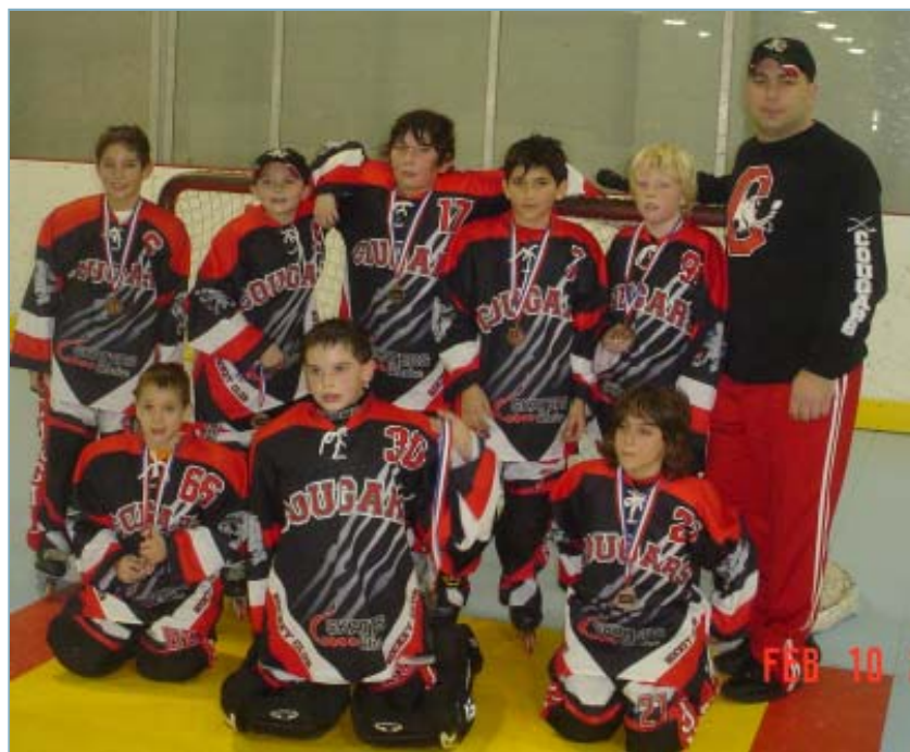
The Skater's Choice Cougars 2007 10U NAYRHL Team

North American Roller Hockey League games, weekend roller hockey tournaments, the home rink tournament series: "Cougarmania", usually attend a national roller hockey tournament at the end of the season